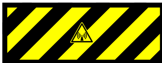
Example no. 2